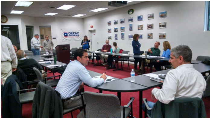
Municipal planning and DPW staff attend the SE CT Stormwater Collaborative meeting in October 2018.

ECCD and the Southeastern Connecticut Council of Governments (SCCOG) have joined together to engage towns in southeastern Connecticut in the establishment of the Southeastern Connecticut Stormwater Collaborative. This project, funded by the Community Foundation of Eastern Connecticut, will bring southeastern Connecticut towns together to promote and facilitate the sharing of ideas, information and resources to assist with the management of stormwater and the implementation of the 2016 MS4 stormwater general permit.