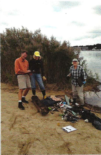
Coastal Clean Ups

Promoting healthy water by reducing nitrogen pollution, bacterial contamination and plastic waste