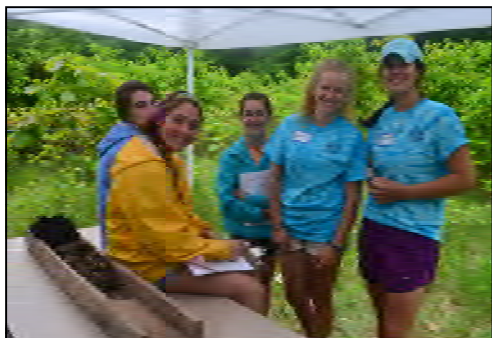
A team of students completing the soils exam on field day

The District provided services to municipalities by reviewing development plans and wetland boundaries , as well as serving as wetland agent in Somers, Bolton, and Granby, and acting wetland agent in Windsor. The District also assisted landowners with natural resource concerns.