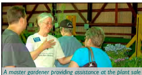
A master gardener providing assistance at the plant sale

The Plant and Seedling Sale and Fish Fingering Sale were successful fundraisers, promoting ecological landscaping and open space enjoyment. Master Gardeners contributed vast knowledge at the plant sale. Related workshops were held, including planting for wildlife, CT forest history, and planting & pruning.